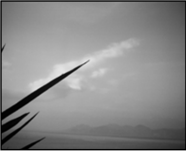
Palm leaves and mountains