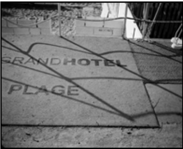
Hotel Carlton Plage