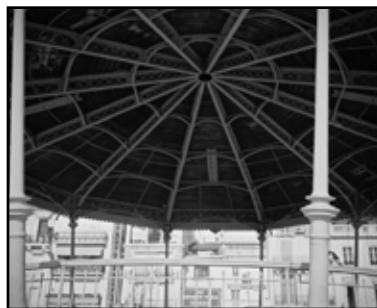
Gazebo on the Croisette