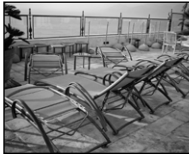
Hotel Sofitel Terrace