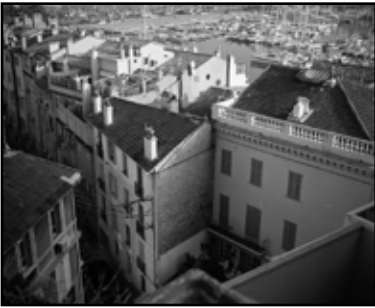
View of city from Hotel Sofitel terrace