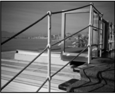
View of Cannes Harbour