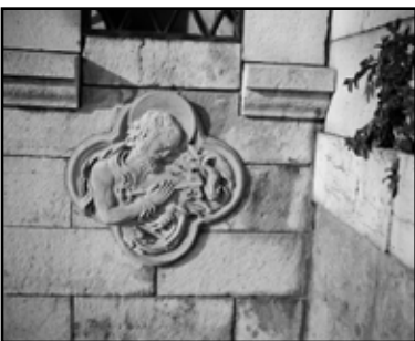
Detail of Stone Relief