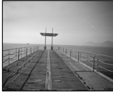
Hotel Carlton Pier