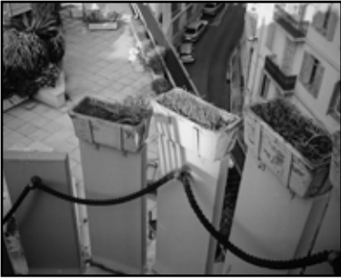
View of street from Hotel Sofitel terrace