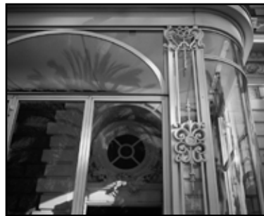
Hotel Carlton Entrance from terrace