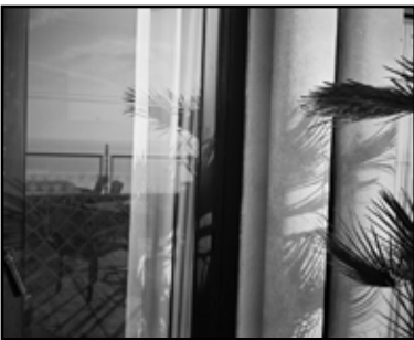
Palm leaves and window from Hotel Sofitel