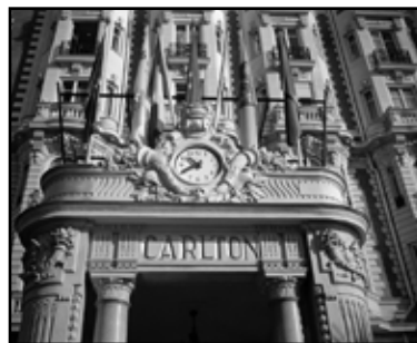
Detail, Hotel Carlton