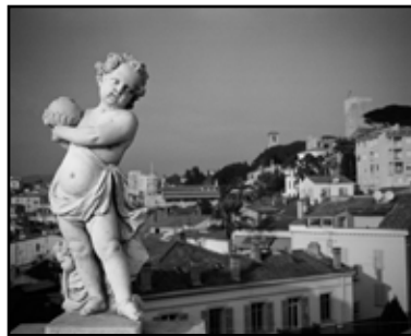
Statue and view of Old Cannes