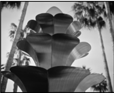
Fountain and palm trees