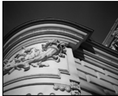
Hotel Carlton Entrance