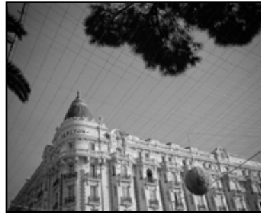
View of Hotel Carlton from Croisette